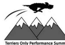
Terriers Only Performance Summit

FIRE/POLICE/AMBULANCE Jefferson County, Colorado 911