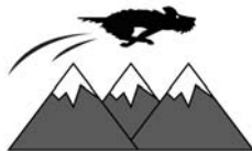
Terriers Only Performance Summit

ENTRIES RESTRICTED TO BREEDS IN THE TERRIER GROUP