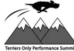
Terriers Only Performance Summit