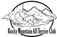
Rocky Mountain All Terrier Club

Obedience Saturday, August 22, 2015 (Event # 2015626311) Sunday, August 23, 2015 (Event # 2015626312)